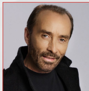
Lee Greenwood "God Bless the USA"